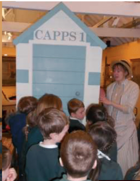
The children also learnt about the seaside in Victorian times. They tried on Victorian swimwear, wore hats and walked down the 'promenade' and also found out what a penny lick was!