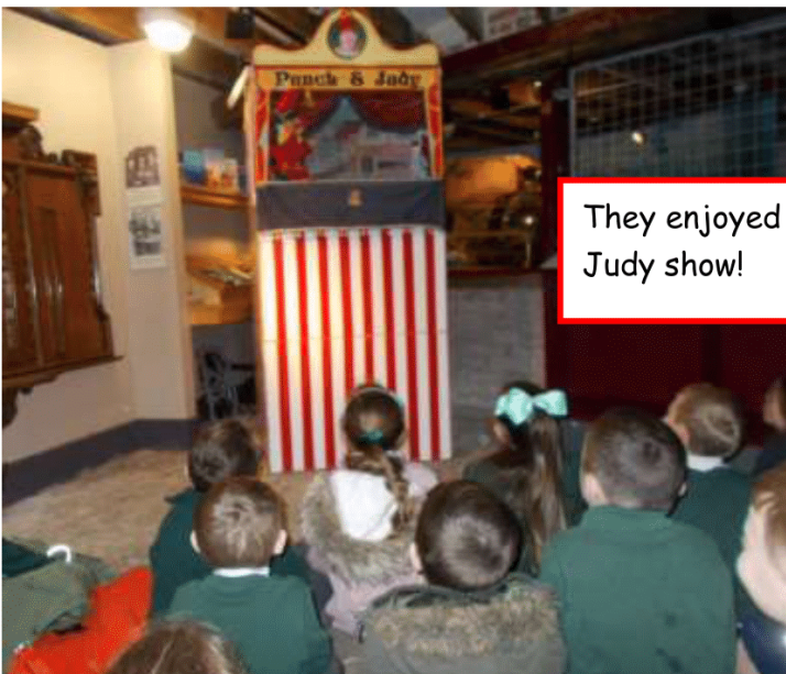
They enjoyed watching a Punch and Judy show!